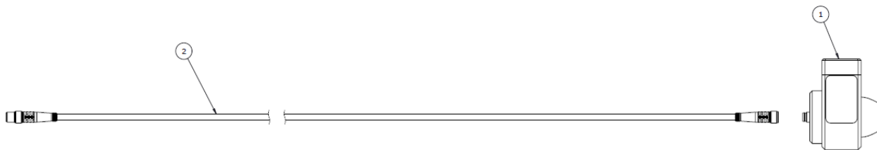
Figure 3: Wiring to WCM-02

*RoadWatch is a trademark of Commercial Vehicle Group and is in no way affiliated with PreCise MRM or FORCE America, Inc.